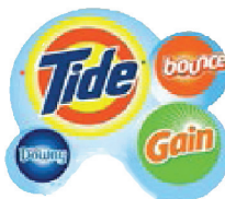
Proctor & Gamble Soap $74.50 case