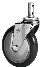
5" Mega Gray Caster $13.00

Join us at our Shows for the best pricing of the year