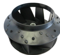
Blower Fan Assembly $165.00